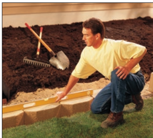
1. Prepare Wall Location