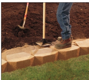
2. Place & Compact Backfill