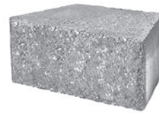
#839 - Straight Unit

Before specifying a specific product, please confirm availability with your local Keystone Hardscapes producer.