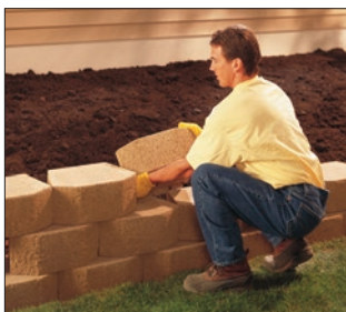
3. Install Additional Courses