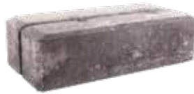
#110240 - Lenza Wall Block

The Lenza Wall is the newest wall innovation. Perfect for decorative walls, fire pits or outdoor grill stations, the clean lines of the Lenza Wall will be a showstopper.