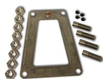
New Construction Jig with Anchors 500-5000A

Due to printing technology actual color may differ.