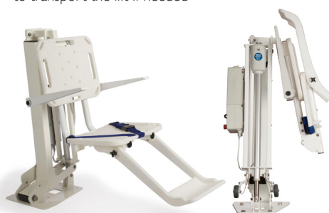
Optional folding seat assembly

A flanged pool lift, with left or right side mounting, and optional folding seat version. multiLift comes standard with a LiftOperator® control system.