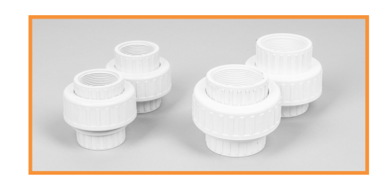
Union Connections (1-1/2" and 2" diameters)

E3T pool and spa heaters are compact, come standard with union connections, and are easy to install. They are the perfect solution for a new pool or spa, as well as to replace any existing pool or spa heater. Available in 5.5, 11, 18 and 27 kW.