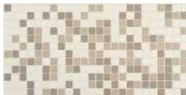
Totally Neutral A67 1 x 1 Mosaic Blend (40% Biscuit A13, 30% Willow A91, 30% Plaza Taupe*)