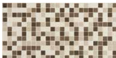
Mocha Cream A69 1 x 1 Mosaic Blend (30% Almond A24, 25% Nutmeg A37, 30% Willow A91, 15% French Roast A15)