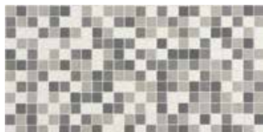
Snow Leopard A68 1 x 1 Mosaic Blend (30% Ice White A25, 15% Charcoal A33, 25% Storm Gray A22, 30% Light Smoke A43)