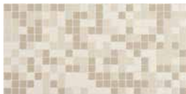
Shimmering Sand A66 1 x 1 Mosaic Blend (33% Almond A24, 33% Biscuit A13, 34% Willow A91)