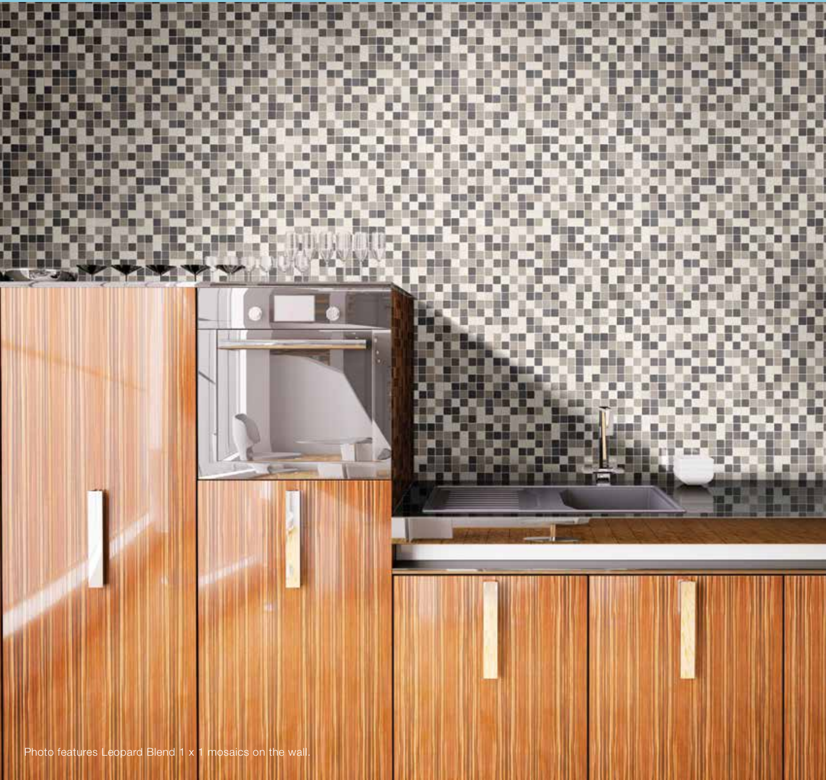
Photo features Leopard Blend 1 x 1 mosaics on the wall.

Always a classic, American Olean's Unglazed ColorBody Porcelain Mosaics provide unlimited options for virtually any space. From sophisticated neutrals to saturated deep tones to crisp, contemporary brights, the palette delivers on today's color trends. The size and shape options complete the design story, while standard and custom pattern options offer true freedom of expression.