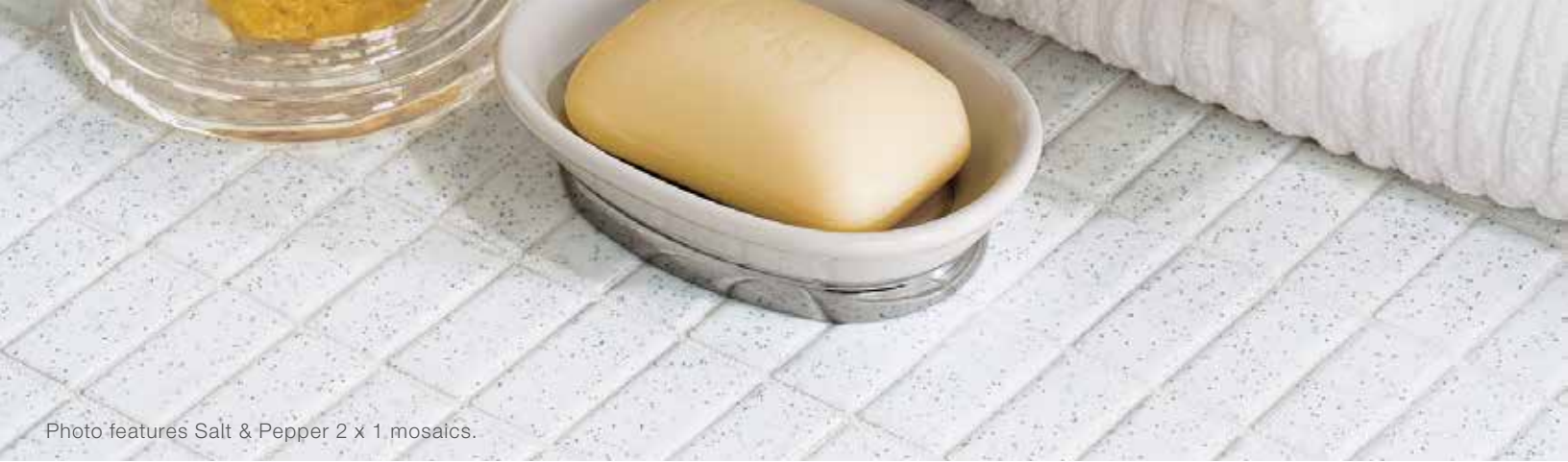
Photo features Salt & Pepper 2 x 1 mosaics.