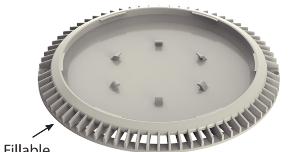
Fillable Drain Cover