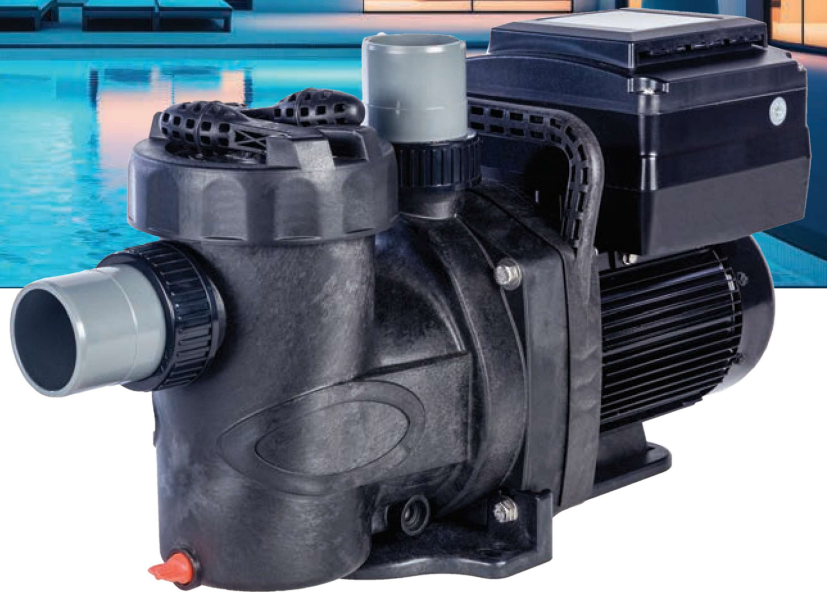
BADU ® Pro-V UVS (2.7THP) (WEF: 7.766, HHP: 1.405)