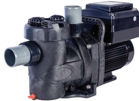
BADU Pro-III UVS

Our flagship pump, the BADU® Pro was designed with pool service pros in mind. A drop-in replacement for both the Hayward® Super Pump® and Pentair® SuperFlo®, it directly replaces the majority of pumps on the market.