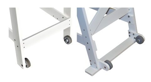
30" Chair Wheel Kit 42" Chair Wheel Kit

Designed to complement any aquatic environment, Sentry<sup>™</sup> lifeguard chairs provide an elegant look that will stand the test of time.