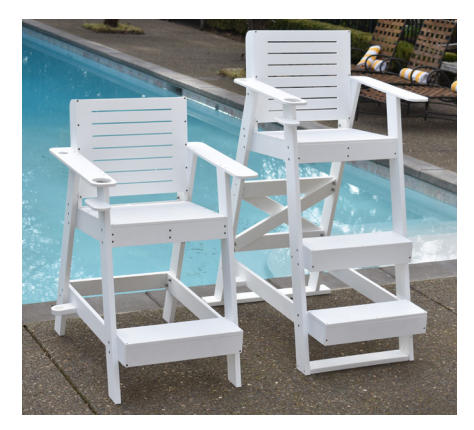
Sentry ^{\text{TM}} 30" and 42" seat height lifeguard chairs