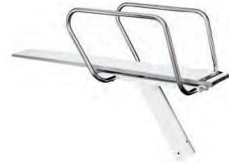
2/3 Meter Deck Level Comes primed and ready to paint.