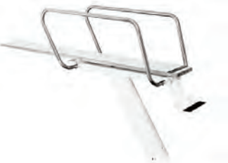
Econoline 1 meter stand with back step, comes primed and ready for paint.