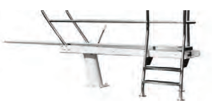
Deluxe 1 or 3 meter stands that come with stainless steel handrails, an adjustable fulcrum, and are primed and ready for paint. Options include back, left, right and dual mounting styles.

Heavy-duty diving towers designed for commercial aquatic facilities. Our towers pair with a variety of 8' to 16' boards, and are designed for a wide range of usage levels and pool envelopes.