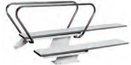
Steel Meter ½, ¾ and 1 meter stands that come powder-coated in radiant white (1 meter requires handrails).