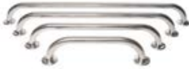
Bent Rails with Flanges