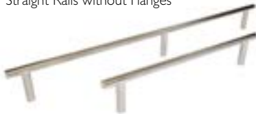
Straight Rails without Flanges

• No Sealed Steel or Powder-Coated on flanged models.