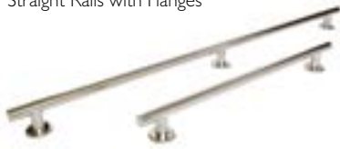
Straight Rails with Flanges