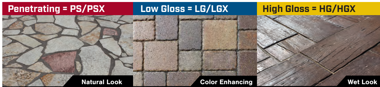
Penetrating sealers create an invisible protective barrier. Available in Paver Seal (PS, PSX), Wetcast Seal (W-PSX) and Premium Stone Seal (S-PS, S-PSX).