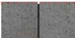
PAVERS OR NATURAL STONES WITHOUT CHAMFER