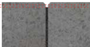
PAVERS OR NATURAL STONES WITH CHAMFER