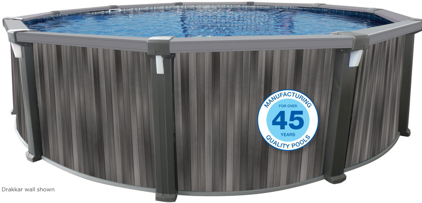
Drakkar wall shown