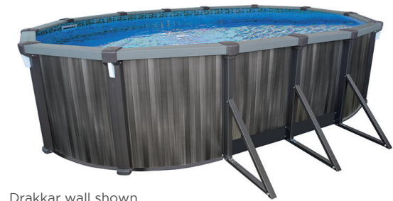
Drakkar wall shown

12'x18' 12'x21' 12'x24' 15'x24' 15'x30' 18'x33'