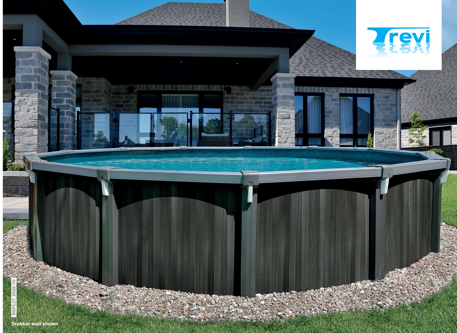
Drakkar wall shown