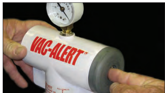
FIGURE 4. Test for an air leak by tapping the vent hole (the gray end of the SVRS unit).