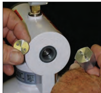
FIGURE 2. Remove security cap with the spanner tool.