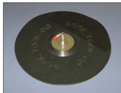
FIGURE 9. Test mat.

In lieu of a test valve, place a test mat (Fig. 9) over the main drain to simulate an entrapment event.