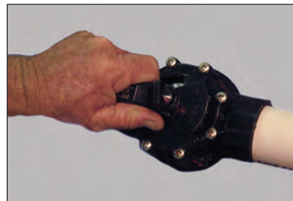
FIGURE 8. Fast-acting, full port test valve.

The unit is easily tested by closing the fast-acting test valve installed between the unit and the main drain while the circulating pump is fully primed and running. Close the test valve quickly, with a quick snap: open-shut-open. Closing the test valve this way simulates an entrapment event (Fig. 8).