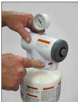
FIGURE 7. Reset lever. In the up position before being reset, and the down position after being reset.