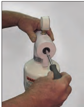
FIGURE 6. Turn the adjustment screw.