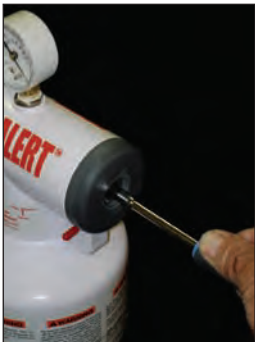
FIGURE 5. Lock open the piston.