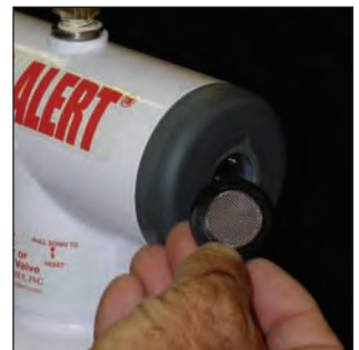
FIGURE 3. Remove the vent screen.