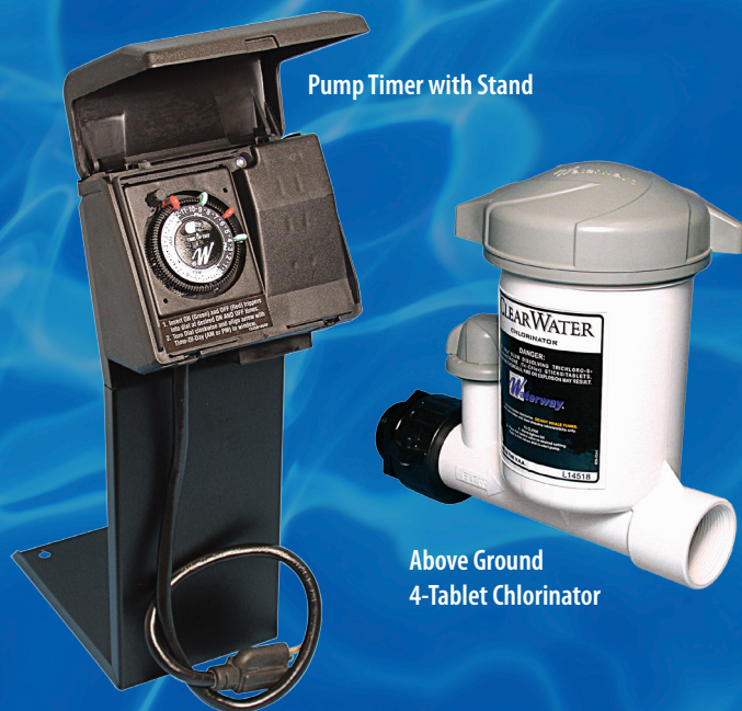
Pump Timer with Stand